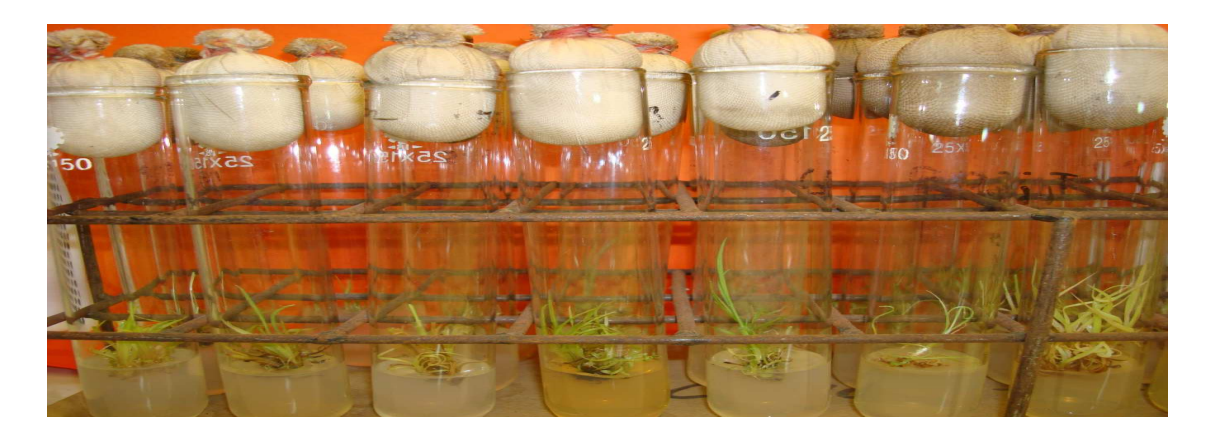
Figure 1. Shoot produced through tissue culture technique